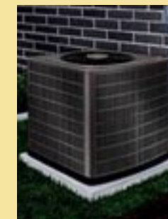
» Air Conditioners

Additional services will be billed at prevailing rates.