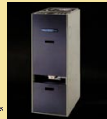
» Oil Furnaces